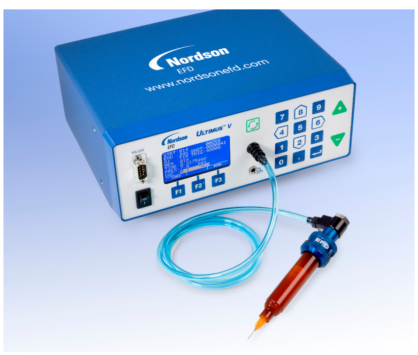
High-precision benchtop fluid dispensing control for advanced applications, two-part epoxies, and fluids that change viscosity.

High-precision benchtop fluid dispensing control for advanced applications